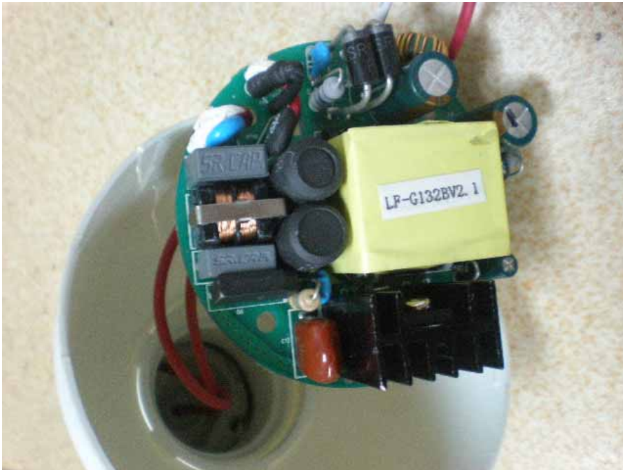
Figure 3 Inside of the EUT