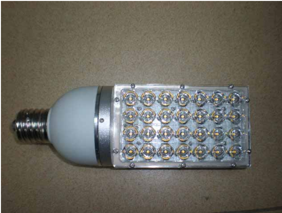
Figure 1 General Appearance of the EUT